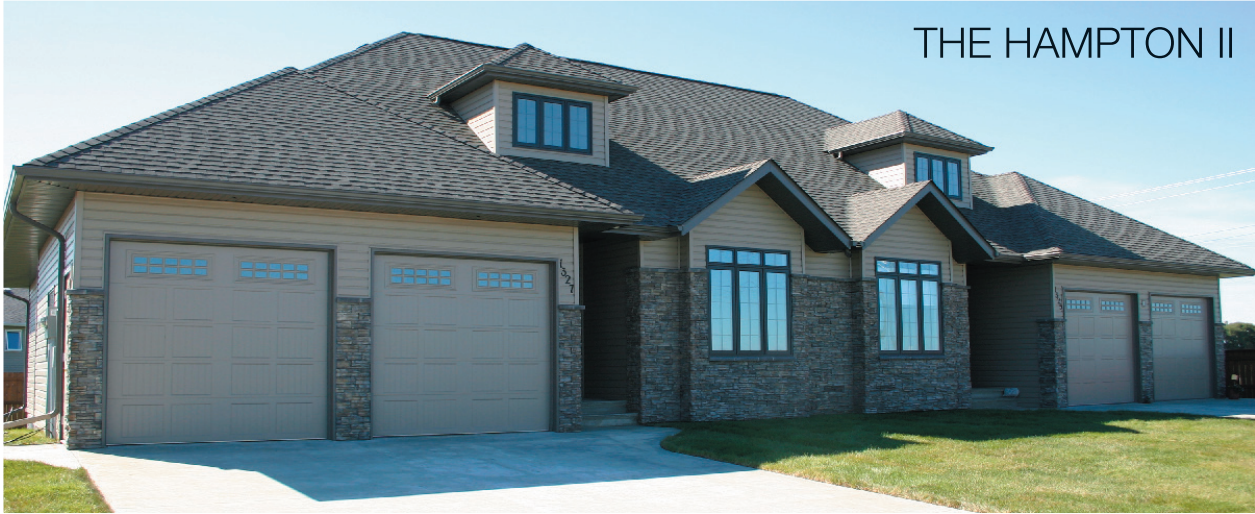
THE HAMPTON II