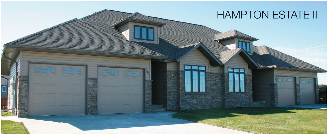
HAMPTON ESTATE II